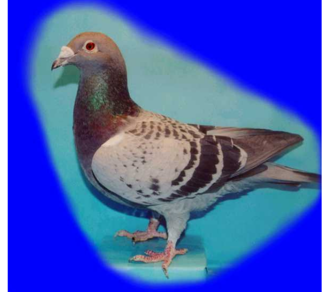
One of her grandchildren (associating with the